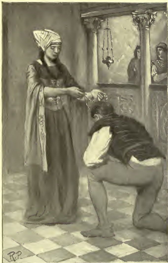
CLAUDIA GIVES SIR GERVAISE A CHAIN OF GOLD TO WEAR AS HER FAVOUR.